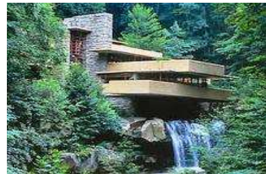
(Photograph of Fallingwater)

That was my trip to Fallingwater. I think you should visit Fallingwater because it is beautiful.